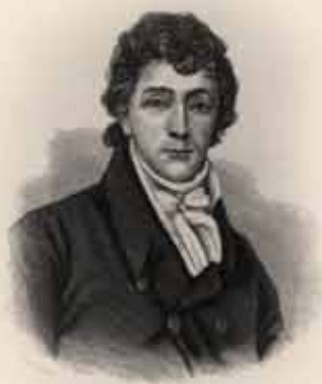
FRANCIS SCOTT KEY

Key wrote a four stanza poem telling the events of the night, which was published in newspapers and swept the nation. It was later put to music, and in 1931, Congress declared it the official anthem of the United States.